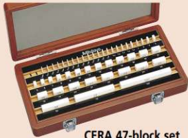
CERA 47-block set