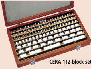
CERA 112-block set