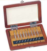
CERA 9-block set (0.991 to 0.999 mm)