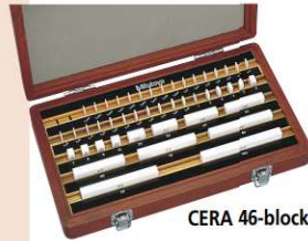
CERA 46-block set