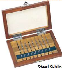
Steel 9-block set (1.001 to 1.009 mm)