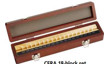
CERA 18-block set