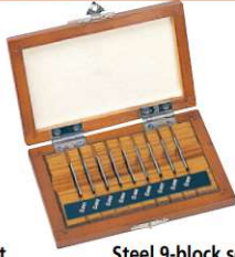
Steel 9-block set (0.991 to 0.999 mm)