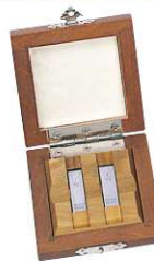
Steel (1 mm)