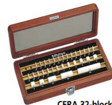
CERA 32-block set