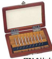
CERA 9-block set (1.001 to 1.009 mm)