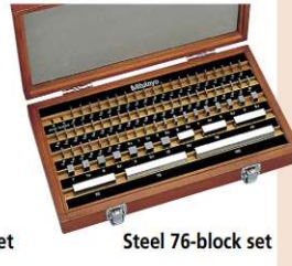
Steel 76-block set