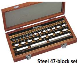
Steel 47-block set