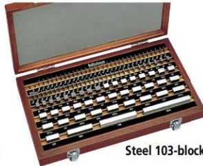
Steel 103-block set