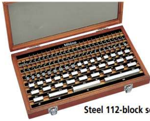
Steel 112-block set