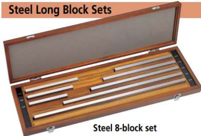
Steel 8-block set