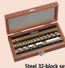
Steel 32-block set