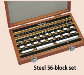
Steel 56-block set