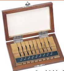
Steel 9-block set

Note: Details of the contents of any particular set are given on page E-9.