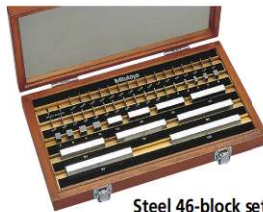
Steel 46-block set