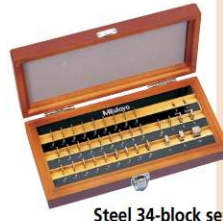
Steel 34-block set