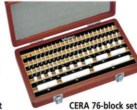
CERA 76-block set