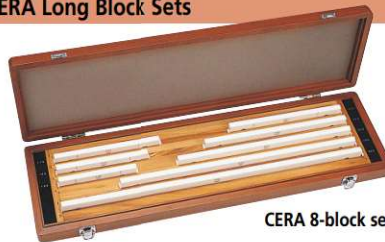
CERA 8-block set