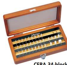
CERA 34-block set