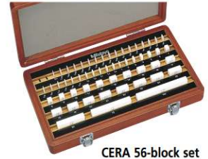
CERA 56-block set