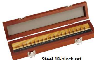
Steel 18-block set