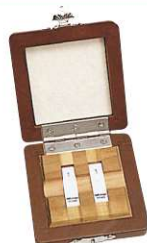
CERA (1 mm)

Note: Details of the contents of any particular set are given on page E-10.