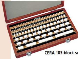
CERA 103-block set